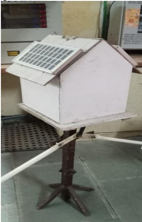
Figure 3. prototype of secure smart agriculture monitoring system

The developed system was tested under different environment conditions to observe its performance and accuracy. The sensors successfully collected real-time data such as soil moisture, temperature, and humidity from the agriculture field. The ESP8266 microcontroller processed the data efficiently and transmitted it using the MQTT protocol over a Wi-Fi network. The data received on the user interface was found to be stable and timely, allowing continuous monitoring of field conditions. The system responded properly to change in environment parameters, which make it useful for decision-making in irrigation and crop management. The use of a solar panel as a power source ensured uninterrupted operation of the system, especially in areas where electricity supply is limited. This makes the system reliable and cost-effective for rural applications. However, slight variations in sensor readings were observed due to environment factors, which can be improved due to environmental factors, which can be improved by using high-precision sensors in the future. Overall, the system demonstrated good performance and proved to be an effective solution for smart agriculture monitoring.