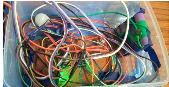
Figure 1. Internal Circuit Setup of the Proposed System

This system is developed to monitor agricultural conditions using IoT technology. It gathers data from different sensors and transmits it to the user through wireless communication. The system provide efficient secure transfer of data.