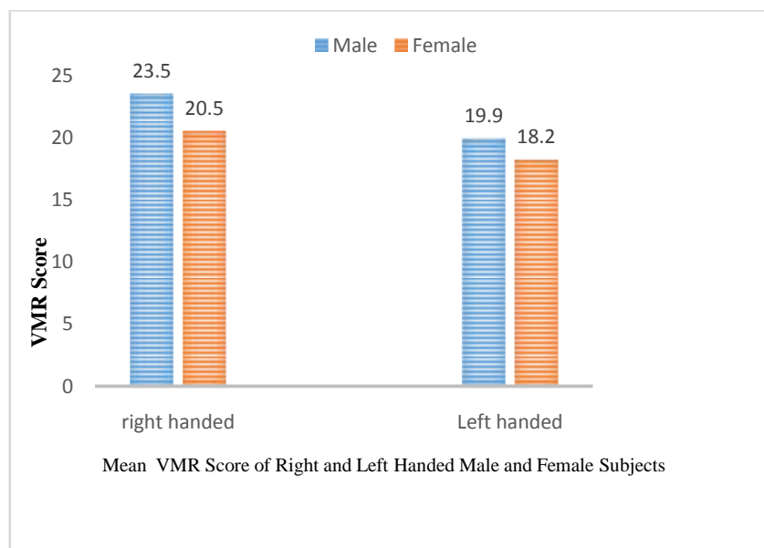
Fig-1: Mean Vandenberg Mental Rotation (VMR) scores a function of Sex and Handedness (left handed and right handed)

Figure-1 exhibits mean Vandenberg Mental Rotation(VMR) scores as a function of sex, handedness from 0 to 40. Mean score for right handed males was 23.50, whereas mean score for left handed male observed as 19.90. Mean score for right handed female was 20.80 and mean score for left handed female was 18.20.