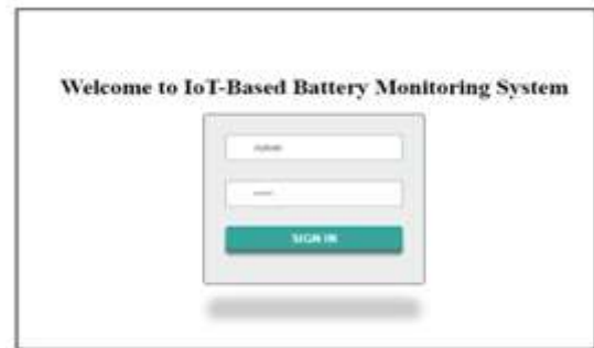
Fig.05: User interface for the proposed battery monitoring system