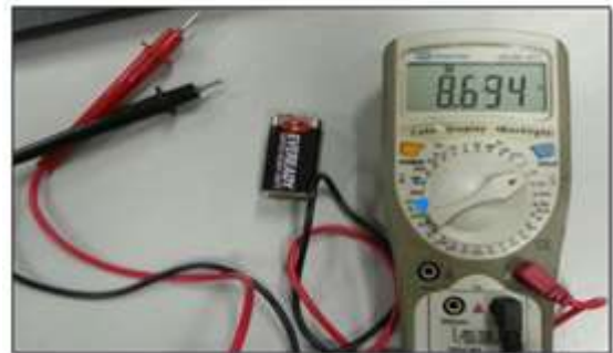
Fig.1 Battery voltage measurement using millimetre

As seen in Figure 1, a millimetre was used in this experiment to measure the values of five (5) batteries. Then, as illustrated in Figure 2, these values were contrasted with those of the identical batteries that were linked to the voltage sensor circuit. Showing the variations and accuracy percentage between the two figures is the goal. The voltage levels of the chosen batteries were changed. Both new and old batteries were included. These variations will be evident in the measurement findings.