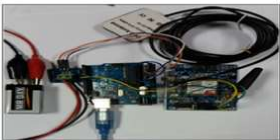
Fig.4 : Hardware for the developed battery monitoring system.

The SIM808 module plus a voltage sensor make up the suggested battery monitoring system in this study. In the preceding subsections, experiments and analysis were presented to demonstrate the features and utility of the sensor and module. Thus, the utility of the battery monitoring system is illustrated in this subsection. The battery monitoring system's built hardware circuit is displayed in Figure 4. The SIM808 module is linked to the voltage sensor in the figure. It has been confirmed that the system can concurrently show coordinates and voltage readings. With a one-minute lag, the coordinates and voltage values are updated in real time. When the battery voltage is less than 2.8V for less than 2.4 hours, the marker will bounce.