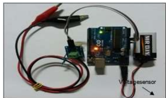
Fig.2: Battery voltage measurement using voltage sensor circuit.

The correctness of the GPS coordinate was ascertained in this subsection by verifying the SIM808 GSM/GPRS/GPS module's characteristics. Additionally, this experiment will ascertain the module's usefulness. The module's experimental configuration is depicted in Figure 3. Five (5) distinct target sites were used for the trials, and each location's GPS coordinates were gathered. The coordinates obtained from the Google Maps website were then contrasted with these GPS coordinates.