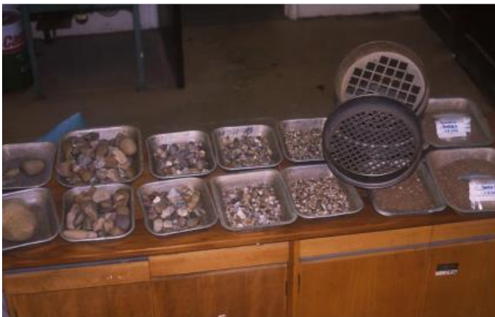
Fig. 1: Sieve Analysis Showing Aggregate Size Distribution [78]