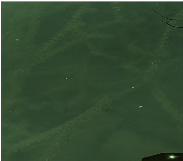
Fig. 3. Thick and wild growth of underwater vegetation obstructing sunlight.

The findings of this study vividly explain the inter-relationship among the different physiochemical properties of the freshwater ecosystem. Due to continuous discharge from the industries nearby and the water-treatment plant, the surface temperature of river water always remains higher than the normal temperature of the surrounding. This is one of the factors that directly affects the dissolved oxygen concentration of the river water as the atmospheric oxygen does not dissolve rapidly in warm water. The rapid growth of vegetation (algal bloom and growth of macrophytes) and their rapid death and decomposition often utilizes the available oxygen in the water and decreases the pH of the water body. This change in the water body has extreme implications on the aquatic ecosystem. The cultural eutrophication aggravates this process to such an extent that the entire fauna is killed and the aquatic body is described as 'dead'.