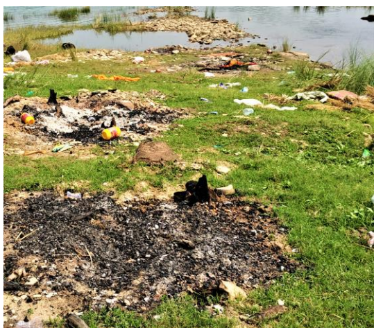
Fig. 1. Cremation ground on the river bank.