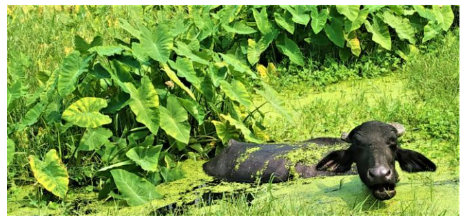
Fig. 5. Algal bloom and rapid growth of macrophytes depicting eutrophication.

The phosphates and nitrates are very essential for the sustenance of the aquatic life. These nutrients may be present in particulate or in dissolved form. These phosphates and nitrates present in the environment often undergo conversion from one form to another through nutrient cycle. Naturally, the phosphates are present in the sewage and decaying matter as orthophosphates, which are utilized by different life forms for their growth. Chemically, the phosphates occur as polyphosphates that are major constituents of soaps, detergents, fertilizers and pesticides, which are later converted into orthophosphates. Nitrogen in the form of Nitrates is mostly present in sewerage.