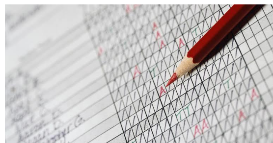
Fig 2: Manual attendance

students it will take away a lot of time and energy and also it will be a burden for the teachers and staffs. When attendance are taken manually there is always a chance of making some errors like marking absent to a wrong person or accidentally switching data or inconsistency in data, duplication in data.