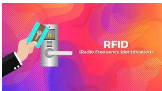
Fig 3: Radio Frequency Identification