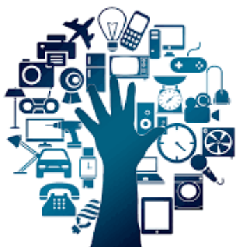
Figure 1 : Internet of Things

advanced levels of services and practically change the way people lead their daily lives. Advancements in medicine, power, gene therapies, agriculture, smart cities, and smart homes are just a very few of the categorical examples where IoT is strongly established.