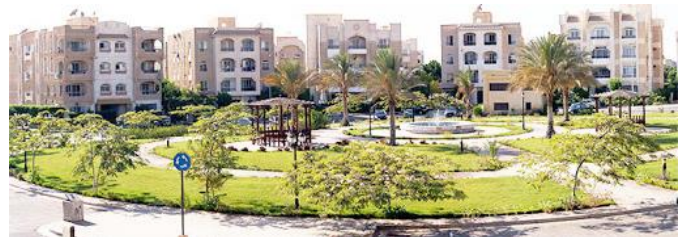
Fig. 3. Beverly Hills project in Sheikh Zayed City

In case the project has been already built, NUCA can recapture part of the land which happened in Beverly hills project in Sheikh Zayed when NUCA confiscated 50% of land (Fig. 3) or, NUCA can take over the ownership of the assets in terms of residential units or buildings which happened in the Nassaïem project in 6th of October city (World Bank, 2006). To sum up, NUCA has set certain mechanisms to dispose the land in new urban communities to the real estate investors. The investor, whether an individual or a company, has the right to apply for the land through official application includes required supporting documents to ensure his capability and commitment to develop the land. Once the investor's request is approved, an agreement is made between NUCA and the investor to determine the implementation schedule and the financial issues related to the land. Then, a legal document (Takhsis) is issued under certain agreed conditions. Failing to commit to this agreement can end up canceling the ownership.