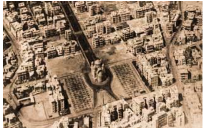
Fig. 1. Aerial view of Heliopolis in 1929

This trend changed in the 1990s when a new approach for the