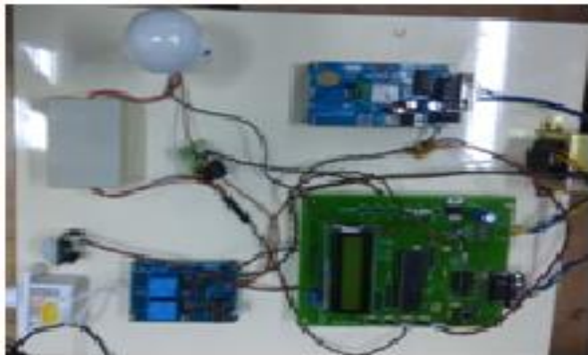
Figure 3 Energy efficient street lamps with fault detection using GSM module

Fig 3 shows the working model of the energy efficient street lamps