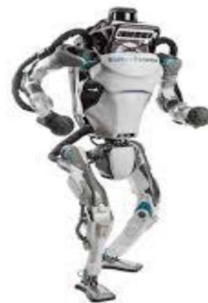
Fig 1. Atlas Robot

Ever since robots have created, humans have always dreamt of human-like robots with legs and hands. Legged robots have received much attention in the last few years. Today's most advanced robots like "ASIMO – a humanoid robot created by Honda in 2000", "Atlas – a bipedal humanoid robot developed by Boston Dynamics", "Nao – programmable humanoid robot developed by Aldebaran Robotics" can tramp along flat and climb along inclined surfaces, climb up and downstairs, and slog through rough terrain. Some of many robots can even jump. These robots require a high level of stability and control for its locomotion. A small area of contact by the feet of the robot on the ground increases the complexity of the design of the biped robot.