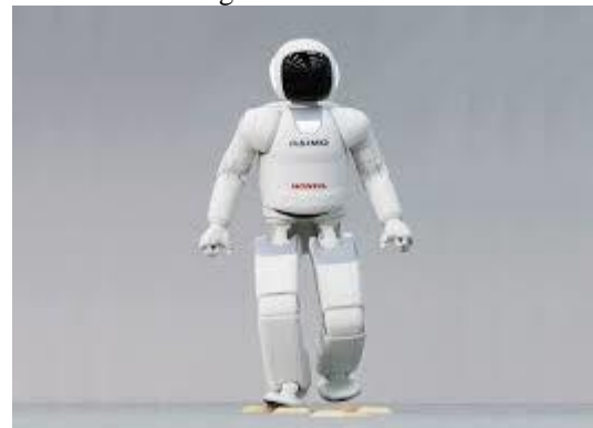
Fig 2. ASIMO Robot

The development of a bipedal walking system is a multidisciplinary subject; it includes mechanics, electricals, electronics, computer science and much more field of studies.