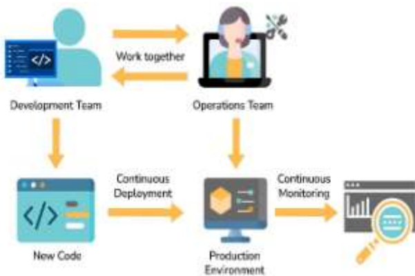
Figure – 1: The lifecycle of DevOps

For cloud-hosted apps and big distributed systems, DevOps architecture is employed. Agile Development is utilized in the DevOps architecture to provide seamless integration and delivery. For DevOps, both development and operations are required in order to provide applications. Analyzing requirements, designing, creating, and testing software components or frameworks are all part of the deployment process. When both Development and Operation are united to work collaboratively in a task, The architecture of DevOps comes into the picture (12). It is made up of several phases that collectively form the DevOps lifecycle. These are the primary components that guarantee DevOps optimizes all development processes, from proposal through production and delivery.