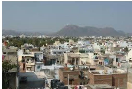
Figure 1- view of Kali-Magri houses

Kalimagri is a medium size village located in Salumbar tehsil of Udaipur district, Rajasthan with total population of 8162 of which 4298 are males and 3873 are females as per 2018 survey report. Majority of the people are followers of Hinduism constituting a percentage of 92. Whereas there are 8per cent of population comprises of Muslims. There were three types of houses, Kuccha, Pucca and Semi Pucca covering percentages of 5per cent, 57per cent and 38per cent respectively. Gram Panchayats are the local political units of rural areas. They monitor the infrastructure and the decision making of the village lie in their hands. The village has its own Anganwadi Centre. It provides facilities like supplementary nutrition, non-formal preschool education and nutrition and health education.