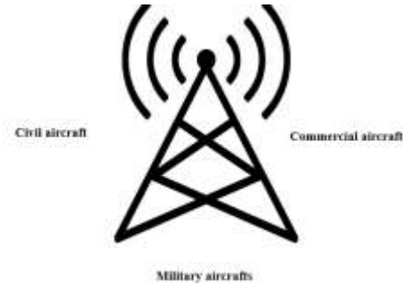
Figure 2. GPS interference

warfare systems. It must also be capable of not jamming the civil aircraft and ensure the pilot does not lose control over it. There is a need to establish resilient navigation and surveillance infrastructure enabling the fighter aircrafts to overcome the GPS outage.