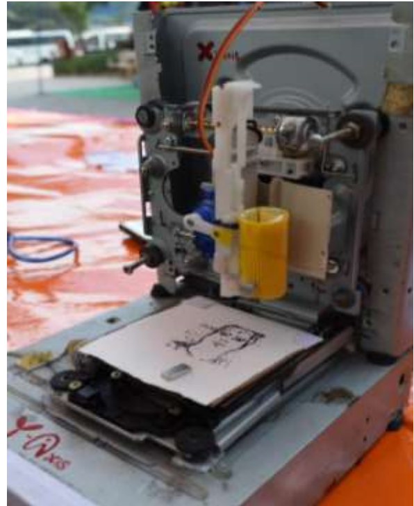
Fig. 2: Mechanical implementation

the jumper wires, can easily be stick to the back of the machine where network of wires is assembled. Compact wiring of the circuit is represented in fig. 3 and fig. 4. Mechanical design of the CNC printer is demonstrated below: