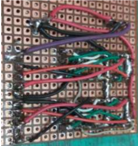
Fig. 4: Back-view of the circuit

It consumes low power and works with precision which could be altered accordingly by the user within the C++ code. In addition to the personal use for small scale application in educational institutes, this project can be resourceful to all generations of the society including kids, youth and elderly people. In the favor of environment, it is ecological in terms of electricity, ink and paper usage. It can be deduced that this CNC Project has wide applications in all spheres of society in an economical approach. However, the cost is an investment into long-term savings, efficiency, client retention and a reputation for quality and reliability. While CNC machining might create tremendous, new opportunities for all kinds of people in society including youths, it might lead to less conventional machining and ultimately, some unemployment. However, most experts do not agree that manual skills will become obsolete. In fact, some think conventional machining will thrive through small and specialty projects.