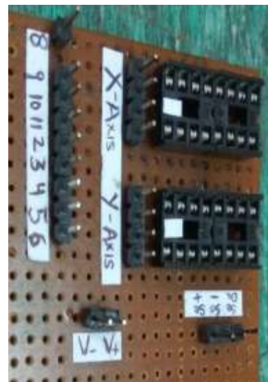
Fig. 3: Front-view of the circuit

Though the archetypal circuit is very complicated to handle so, it is preferred to create a compact one i.e. by minimizing