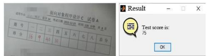
Figure.4. Another successful case

Score summation is the final step of the experiment. The main task in this process is to calculate the true score of each question, and finally sum the scores and output the results. The input and output of another successful case are shown in Figure 4.