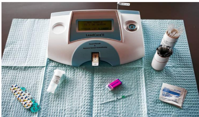
Fig. 1. LeadCare II-Blood Lead Analyzer.

Blood lead levels were determined by "LeadCare II-Blood Lead Test System" (Figure 1). This test is considered to be appropriate for field studies due to its cost-effective, easy-to-apply, portable features, and reliable method (Pineau et al., 2002). Samples were collected by using disposable injectors. 50 \mu l of blood samples were drawn from each worker by using capillary tubes and then transferred into vacuum blood tubes containing ethylenediaminetetraacetic acid (EDTA). The samples were mixed by gently rocking the tubes. The tubes were left to stand upright for a minute. The prepared samples were deposited onto electrode strips and then inserted into the analyzer. Within three minutes, the results appeared on the screen in \mu g/dl. The results were analyzed statistically by using the unpaired student's t-test to compare blood lead levels between worker groups and control group. The correlation coefficient (r) was used to determine the relationship between the blood lead levels and the ages or duration of exposure between worker groups.