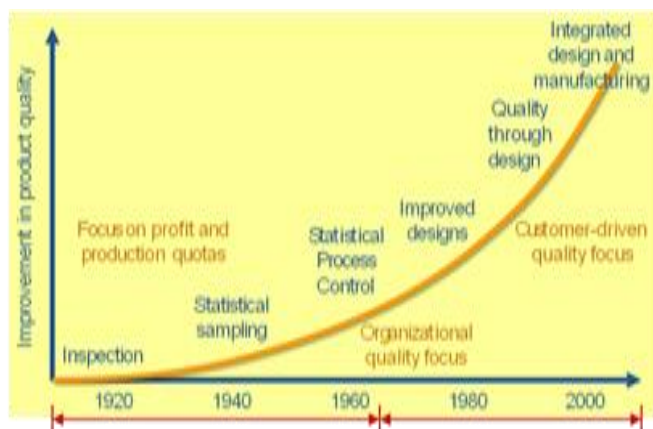
Fig.2 Manufacturing quality Management principles evolution

The following section briefly traces the Birth of Quality Management Principles in manufacturing quality. This is illustrated in Fig-2.