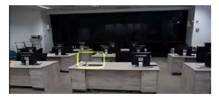
Fig. 5: Object Detection