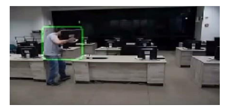
Fig.4: Suspicious moment

5) Classification of activities: Here total number of incoming and outgoing people is counted and saved. The activities of the people are classified into normal and suspicious. Suspicious activities detected like stolen object.