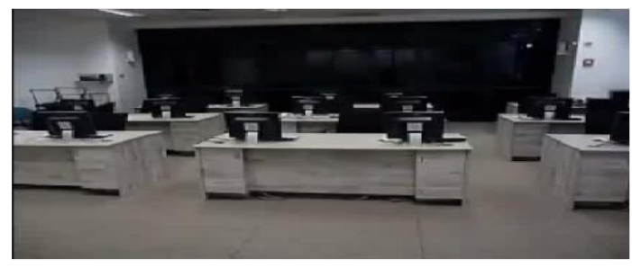
Fig. 2: Background picture

1) Background Model: in this model the background image is dynamically updated. Here allow small changes in illumination and new static object introducing. This background model is so sensitive when illumination suddenly changes.