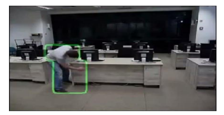
Fig. 3: Tracking Object

Repeat step a through f for all frames in video which is suspicious video.