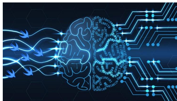
Fig .1 Digital Neuron Connections