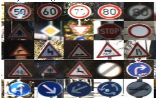
Fig. 2. GTSRB Data Set

For developing a traffic sign detection and identification system, the essential requirement is a traffic sign database. A huge number of traffic sign photos must be present in the traffic sign database. To train the system, a rich dataset with various types of images is required in object recognition. German Traffic Sign Recognition Benchmark(GTSRB) is used for the purpose of traffic sign detection and identification. Description and visualization of the GTSRB dataset was done. After driving for 10 hours on different roads of Germany this dataset was created and this dataset is publicly available. The dataset was reduced to 43 classes and around 50,000 images after removing the repetitive and redundant frames. The size of the images in the dataset is 32x32. Training data and testing data are two parts in which the dataset is divided. Training data is used in the training of the model. The final Neural Network can be evaluated by the testing data.