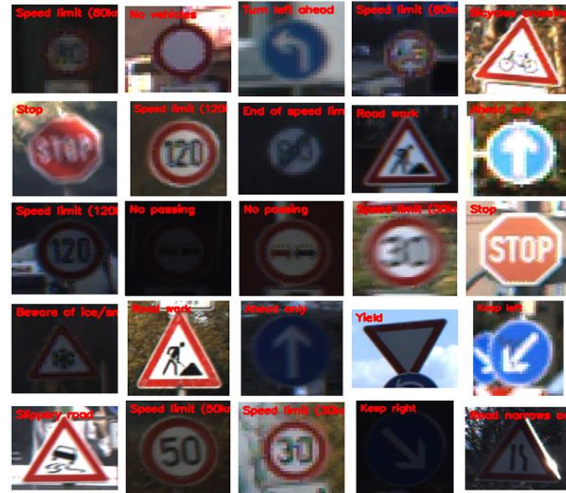
Fig. 5. Result of Traffic Sign Recognition and Classification

A sequential model is used and the set of layers is using a 5*5 Kernel which is helpful for distinguishing between the different color blobs and the shapes of different traffic signs. The result is a more serializable model. The test images are processed with the model and a prediction of results is shown below.