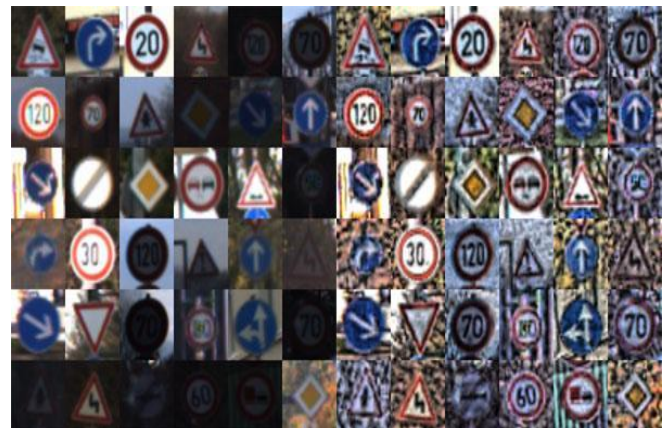
Fig. 1. Original Images are present on the left side. After applying CLAHE, image contrast is improved and the images are seen on the right side

As their performance is so much affected by the prevailing environmental conditions and also various other temporary and permanent situations can affect the perceptibility of road signs. The traffic sign detection and recognition system face difficulties like non-identical traffic signs and bad postage of signs. This paper gives a detailed description of the issues of road sign detection and the solution to many of these problems. CLAHE (Contrast Limited Adaptive Histogram Equalization) has been used in improving the contrast of different traffic sign images. CLAHE is an algorithm whose implementation can be found in the Scikit-Image Library.