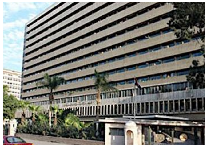
Fig. 7. The Accountability Central Authority building in Medinet Naser , the author

Nevertheless, Nasser's regime's fear of diminishing its political control over the labor force prevented satellite towns' implementation (Serageldin 1985, 123) and shifted to suburban development. Since the villa was the primary residential type in Medinet Nasr , a bright contrast was created. The contrast was achieved due to the authoritarian building's grandeur that stood for the state's power and modernity against the villa size (Figure 7).