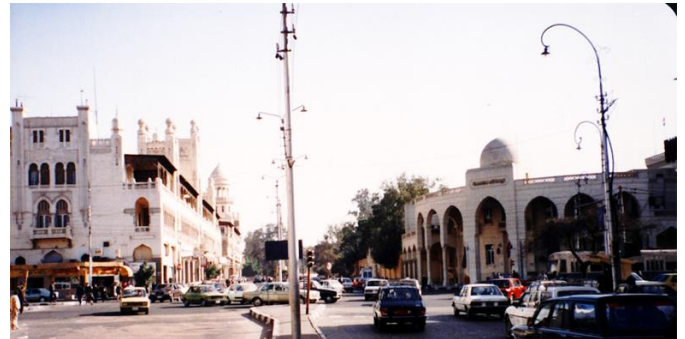
Fig. 6. Heliopolis, the author

Parallel to the intellectual debate about the Egyptian identity, Heliopolis designed and planned in 1910. It was the achievement of a Belgium urban development company owned by the Baron 'Edward Empain'. Its architecture adopted a style that might be considered similar to the 'neo-Mamluk' but in a different visual mixture. Heliopolis's architecture presented a mixture of motives and elements from distinct parts of the Muslim World, from Andalusia to India (Figure 6).