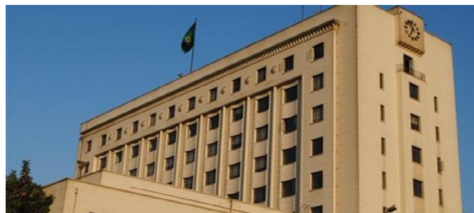
Fig. 2. The Arab League Headquarters

Among all structures built in Cairo Down Town's western area, the Arab League headquarters is the only building showing few Arabic decorations (Figures 2 and 3). Its decorations look very superficial to be considered as part of the building architectural design, especially if the building is compared to other buildings in Cairo Down Town from the era called the 'belle époque.' Following the 1952 movement, many buildings from the old era were converted to state-owned facilities, and significant palaces of the old regime were confiscated by the state and were reused as schools, governmental offices, or military headquarters.