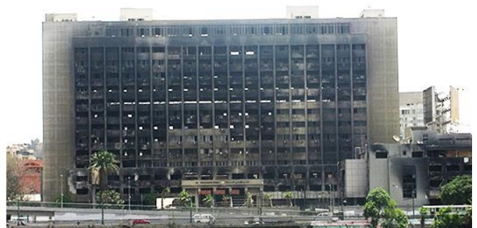
Fig. 4. The Socialist Union after the 25 th of January revolution, the author

The Socialist Union headquarters was constructed in 1958, located northern of Midan el-Tahrir , and overlooking the Nile (Figure 4). It was built over the demolished British Barak and a palace from the Egyptian monarchy to represent the new socialist state's modernity. The emphasis on building's grandeur was intentional because the building represented the socialist state's authoritarian power. Its location overlooking the vast area of Tahrir , the Nile, and the Museum for Egyptian Antiquities increased its visual impact (S. Saad 2018).