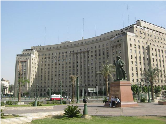
Fig. 5. The Mogamma, the author

Perhaps the genuine triumph of colonialism was not achieved in battles but the fields of culture and education. Culture and education created new embedded historical roots in the way of thinking of both the Egyptians intellectuals and the ordinary Egyptians (S. Saad 2019). During the 19 th and 20 th centuries, European powers were not only invading the east, 'but "European buildings" styles were cropping up in its cities and shaping their appearance' (Rabbat 2010).