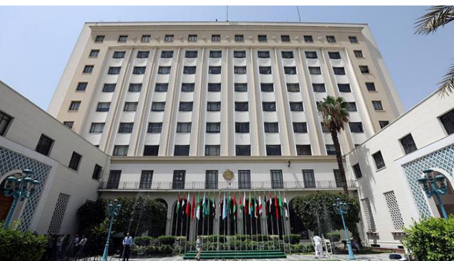
Fig. 3. The Arab League Headquarters' main entrance, the author

The City Centre and the historic Cairo were considered antiquities from a decaying past, thus were treated as touristic site seeing. Since Cairo Down Town was seen as a colonial symbol, it was neglected by the Nasser regime. Few urban interventions took place during the Nasser era, but some old regime's projects were completed. One of Nasser's urban