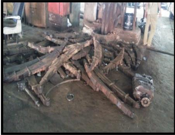
Fig. 5. Lying of spare parts