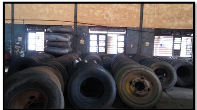
Fig. 8. Proper placement of tiers