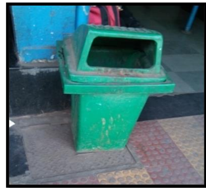
Fig. 13. Dustbin placed for garbage disposal