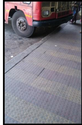
Fig. 12. Clean public area