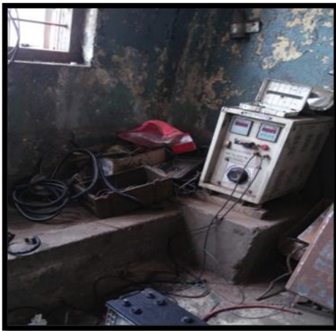
Fig. 1. Open electrical appliances

We observed a lot of cleanliness related issues in the bus depot. We found that uncertain condition of tiers and inner tubes which occupied more working space and created bad appearance for the new visitor. Second thing we observed that spare parts, metal tools and equipment were laying on the floor. Another thing we observed that dust-dirt and unclean washrooms may cause severe diseases like asthma problem, sneezing spread of harmful bacteria, and germs etc. leakage of oil on the floor and litter of garbage may lead to unclean/harmful environment.