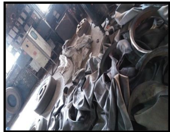
Fig. 4. Uncertain condition of tyre