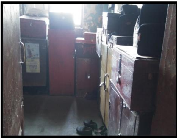
Fig. 10. Proper placement of luggage