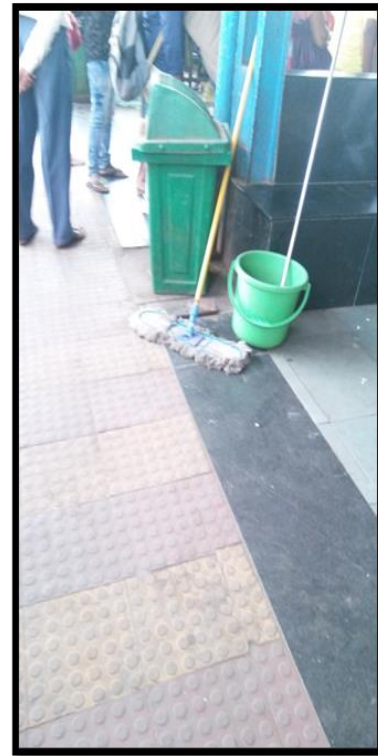
Fig. 7. Use of cleanliness equipment

luggage, proper and safe electrical panel, clean public area and many more new results obtained.