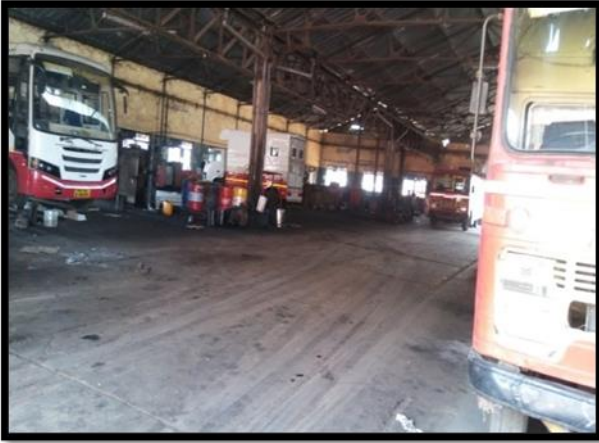
Fig. 9. Clean floor