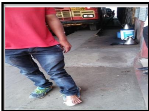
Fig. 2. Injury to worker