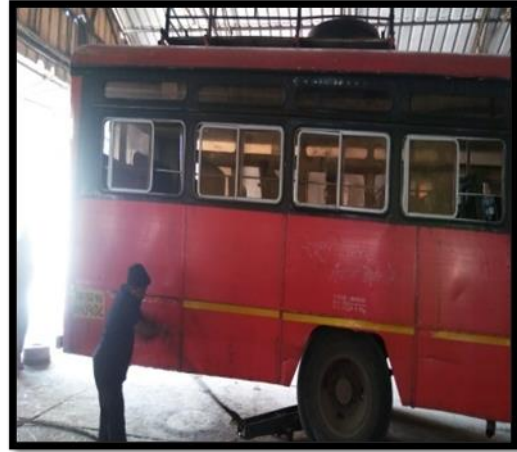
Fig. 3. Missing gloves

We observed a lot of safety related issues in the bus depot. We found that the electric wires attach to the battery were lying on the floor and electrical appliances were open which may cause electric shock and may lead to fire. Second thing we observed that the fire extinguisher was been expired, since many years it has not been refilled or replaced with the new one. The fire extinguisher was been damaged, rusted, depressurized and had loosed its ability to operate properly. Another thing we observed that the worker working in depot was been injured due to cutting tool which was lying on the floor and also safety shoes, goggles, apron, safety gloves were missing during working hours which may cause major damage to health and floor was slippery.