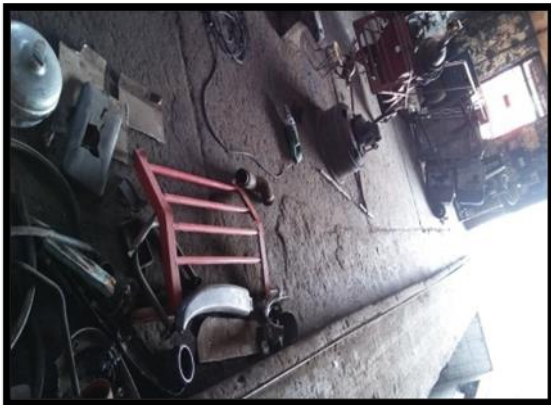
Fig. 6. Unclean floor

At the first settle upon a thesis, so as you can easily receive the relevant information from surrounding. Capture the happening around you which is the most important activity that can be carried out by observation. Once the information is captured, we call it data. Paying attention to each characteristic is very important. Once the information is captured note the observation. Next step is to present the data in most definite manner such that it is simply taken by others. The recorded data should be presented in chief details and only problem report should be presented. For example; fire extinguisher at first floor near head office is observed empty.