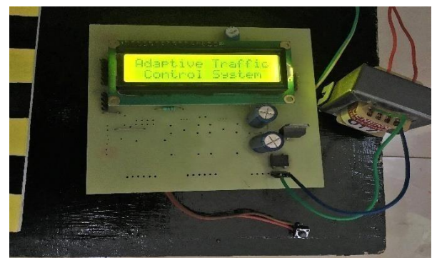
Figure 3 shows LCD and signal interfacing

Above figure shows the prototype design of the proposed system consist of 4 lane and each lane has a sensor which grooved within the board, signal placed at the center.