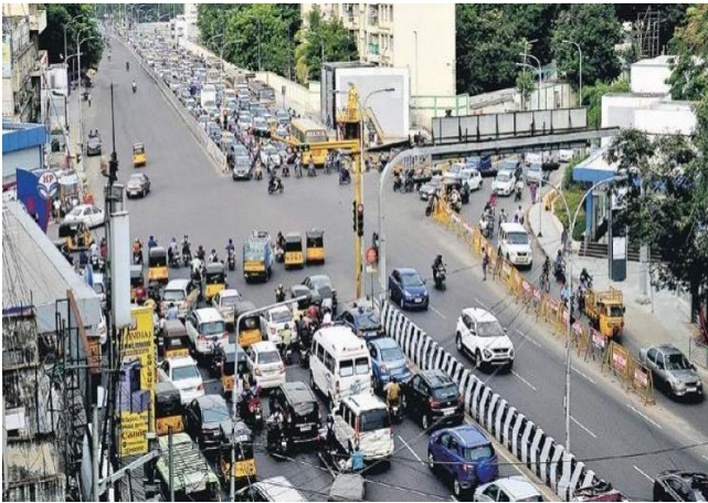
Figure 1 Traffic Congestion