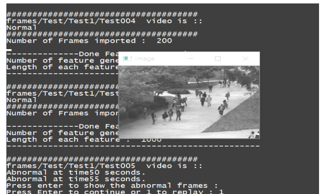
Figure 2: Abnormal event video frame.