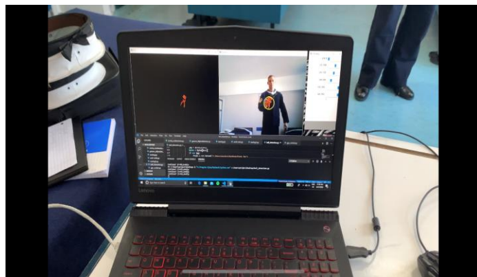
Fig. 5. Object Tracking Procedure

As mentioned above, we used an open source code as the flight algorithm (MultiWii v2.4) and we made the necessary modifications. The object tracking is mainly achieved through the client-computer and the use of the open source libraries from the Open Computer Vision project (Open CV2). Therefore, we developed an algorithm using Python (Avouris, 2019; Chollet et al., 2018) which connects to the ESP-32 and at the same time streams the video feed from the ESP-EYE. The user has the total control of the camera in the beginning through the A, S, D, W and 'space' keys and as soon as he selects a target by using the trackbars and locking onto the desired color, by pressing 'ESC' the system will automatically track the object. More specifically, the algorithm converts the incoming frames from RGB to HSV color space, so that the user can easily choose the desired color and then it creates the contours corresponding to the user's choice. Afterwards in the tracking section, we set two centers, the first one is the center of the targeted object and the second is the center of the incoming image and the algorithm via the correlation of the two centers, sends the corresponding commands to the ESP-32 so that the two centers can meet (Rojas et al., 2017; (Hernandez-Martinez et al., 2015).