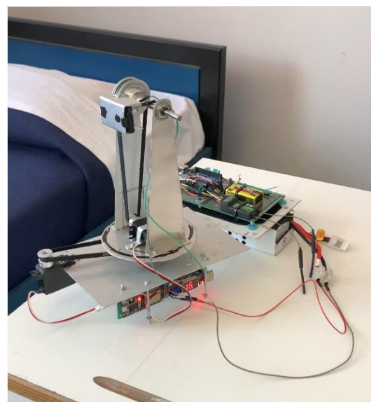
Fig. 4. Camera Powered by the drone's battery

Firstly, we used Arduino Uno as flight controller and the MultiWii as the flight algorithm. We altered the necessary code lines according to our sensors and set up and we also added a code routine for the collision avoidance part. As an accelerometer-gyroscope we used the MPU-6050, four 30amps electronic speed controllers, four motors (700kV) manufactured by SunnySky and the FlySky receiver (Papazoglou & Lionis, 2015; Kalovrektis & Katevas, 2019). As a power source, we used a lithium polymer battery (14.8 V, 50c, 6750mAh) that was able to provide a flight autonomy of 20 minutes. Furthermore, we used two infrared sensors in order to measure the distance of an obstacle in front of and behind the drone, which are connected directly to the Arduino (Srinivasu & Shanthi, 2015).