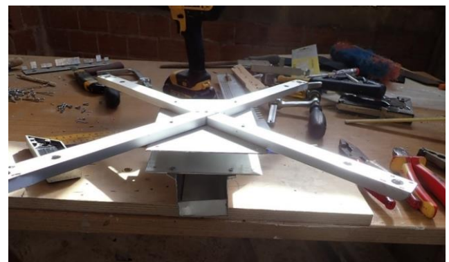
Fig. 1. Drone's Frame

For the construction of the frame we used aluminium as the main material in order to achieve the desired durability and strength. The two axes where the motors are mounted (50cm long each), are made from aluminium channel section and they are pacted in an aluminium sheet (200x140x1.5mm). The electronic parts are placed on an aluminium sheet (200x140x3mm) and the battery is situated in an aluminium made box underneath the whole construction. All the pieces are connected with screws so they can be easily dismantled.