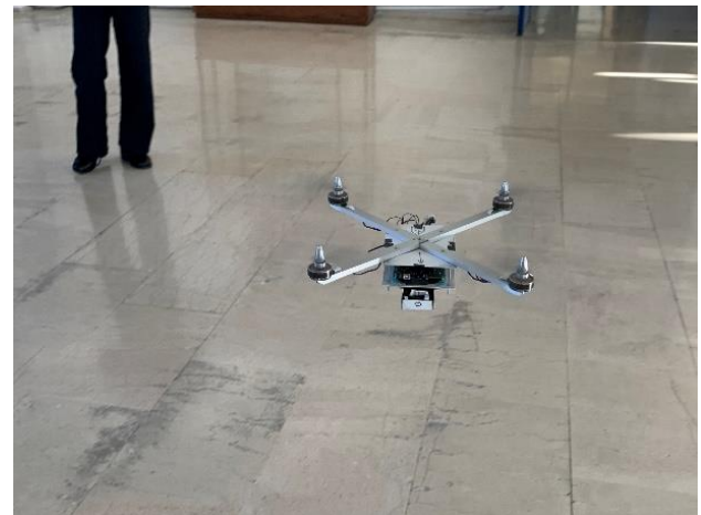
Fig. 6. Drone during take-off

GPS module transmitted successfully the coordinates to him through the ESP-32, so every expectation was met to a certain degree.