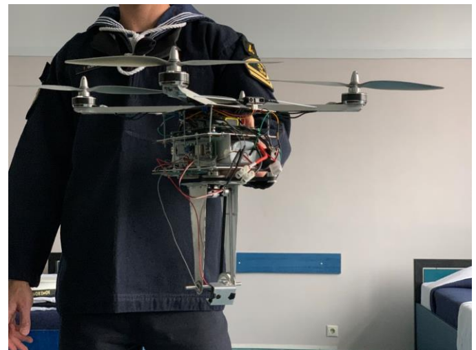
Fig. 7. The drone in its final form