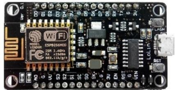
Fig 2. NodeMCU