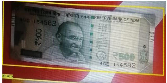
Fig. Processed image

Now the range suggested by RPN will be given as an input to another completely associated neural network and speculate bounding boxes as well as object class.