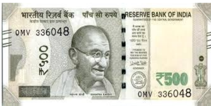
Fig. Original note

To recognize the nation of currency, the banknotes have been segmented into the groups on the basis of blank region's presence and absence. Then, the banknotes will be classified by performing the template matching from the already stored templates that identifies the banknotes from the countries in the each group. For demonstration purpose, the Indian 500 rupee note is chosen. It is shown in below figures, before and after preprocessing steps.