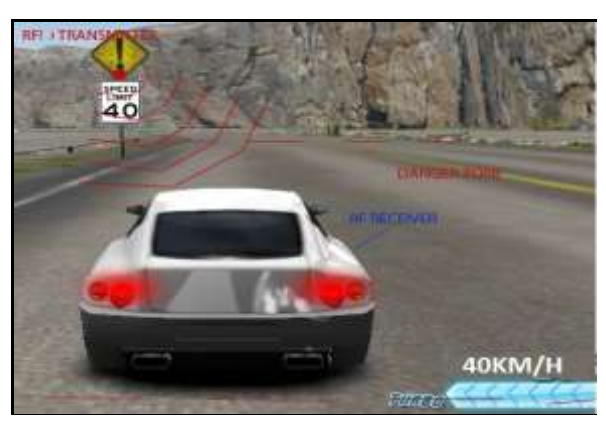
Fig. 1. RF transmitter/receiver antenna on signboard and vehicle respectively.

A constant acceleration i.e., a fixed speed is maintained as per local area selected. When vehicle is out of the restricted, the proposed mechanism goes to its idle position and thereby letting the drive as per his required speed. In this way, it reduces all the drawbacks of previously mentioned works and provides an effective and novel solution for speed control. It is simple and easy to implement the proposed work with reduced cost and handle the speed of vehicle in an effective way.