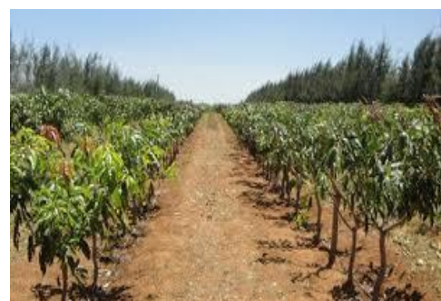
Figure.2. Mango Plantation

The application of flow meters [4] in cultivation and dams are increased within increase in the demand of irrigation, drinking water and power supply using hydraulic power stations. These water flow meters are tool for the cultivators. The case study from a farm filed with mango plantation was collected from the district Agriculture officer and based on the data the required para maters are evaluated. The agriculture if updated day to day with the reforms and agriculture policies in the country, with this the farming is implemented with the natural fertilizers and led to organic farming. Organic farming is a method of crop production that involves not to use pesticides, fertilizers, genetically modified organisms, antibiotics and growth hormones, but for the organic farming also required sufficient uniform flow of water.