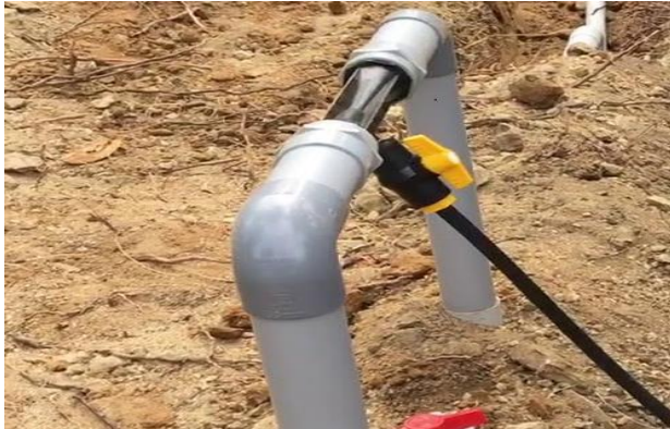
Figure.3. Pipe connected to submerged pump