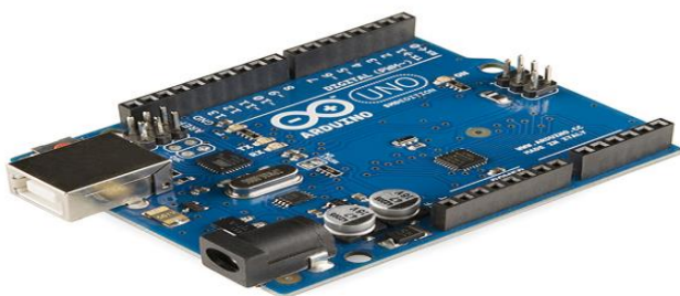
Fig 3: Arduino Uno

The Arduino Uno developed by Arduino is based on Microchip ATmega328P microcontroller. This open source microcontroller board contains sets of digital and analog input and output (I/O) pins. These pins for its easy functioning are interfaced to various expansion boards and circuits. The board developed by Arduino has 14 digital Input/Output pins, 6 analog I/O pins. Another feature of this microcontroller board is that it is programmable with the Arduino IDE, with a type B USB cable. It is powered by the use of a USB cable. However it can also be powered by batteries of small volts, as it accepts voltages between 7 and 20 volts for its functioning. It has got many similarities with Arduino Nano and Leonardo. Original STK500 protocol is used by this microcontroller board for its communication. There are many differences with the other boards similar to Uno as it does not use the FTDI USB driver chip. The Microcontroller board Arduino Uno uses the Atmega16U2 programmed for USB to serial converter.