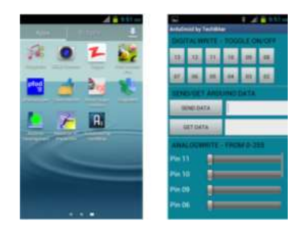
Figure 2. ArduDroid Software logo and running in phone

Published Online September-October 2016 in IJEAST (http://www.ijeast.com)