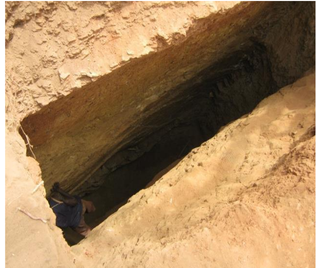
Plate 6: Heavy Earth Removal by Miner

Effects on Biological Environment: The result also shows that artisanal miners create lots of noise in the process of mining particularly in the process of drilling of minerals under the rocks. The vibration nature in the process of mining affect the settlement around the areas where mining takes place for example in Bida area most settlement around the mining site tends to relocate to other areas. Also included on the effects are those created to the fauna. The noise and vibration created affect the animals to be forced out of their natural habitat to other location and the vegetation cover are been cleared for mining activities.