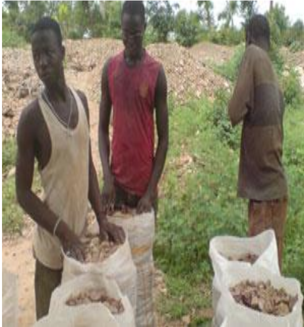
Plate 4: Artisanal Mining Iron Ore in Kontagora

The result shows that artisanal mining involves the miners create harmful effects as a result of digging the minerals come in contact with water bodies thereby releasing heavy and poisonous metals contain in the rocks as gangus are deposited (Plates 5 and 6). This might result in polluting the water bodies and the underground water.