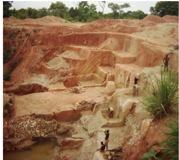
Plate 2: Artisanal Mining Iron Ore in Bida

The miners after digging and extraction of minerals leave the area unreclaimed their by causing serious erosion (Plates 3 and 4).