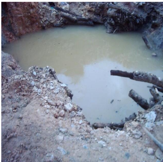
Plate 5: Water in Abandoned Mining Site

The result shows that artisanal mining involves the miners create harmful effects as a result of digging the minerals come in contact with water bodies thereby releasing heavy and poisonous metals contain in the rocks as gangus are deposited (Plates 5 and 6). This might result in polluting the water bodies and the underground water.