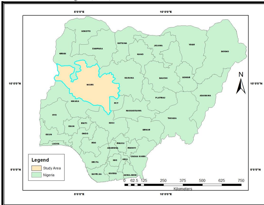
Figure 1: Niger State in Nigeria

Copper, Quartzite, Asbestos, Iron, Silica sand, Granite, Gemstones (varieties). These minerals are available in commercial quantities and can be used for both domestic and export markets if only when fully utilized in a right direction.