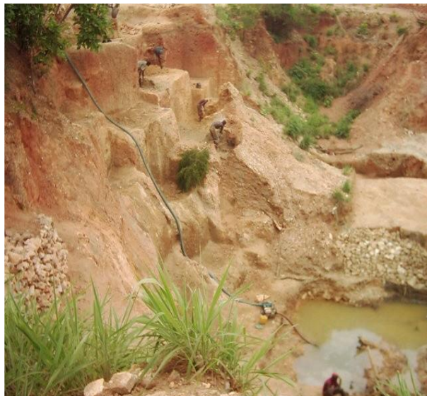
Plate 1: Artisanal Mining Iron Ore in Kontagora

The activities of these artisanal miners as alter the physical nature of the environment. This can be seen in most of the Plates 1 and 2 where the top and nutritious part of the soil are been altered where the nutrient are been carried away as a result of digging of pits and tunnels (lotos), dumping of debris heaps and quarrying.