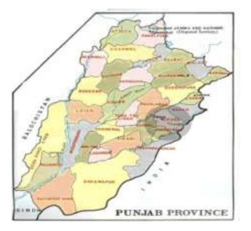
Fig 3.1: Location of study area

The research methodology in the form of flow chart is given in Fig