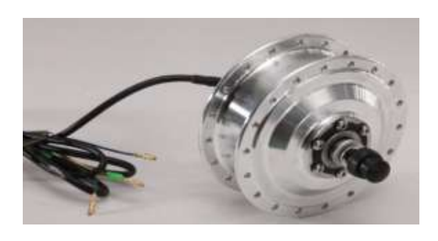
Fig- Hub Motor

Permanent magnets which are placed in a brushless DC motor, those magnets rotate around a fixed armature. An electronic controller replaces brush assembly of brushed motor turning. Brushless motor has more advantages than DC motor which includes more torque more weight and also torque per watt.