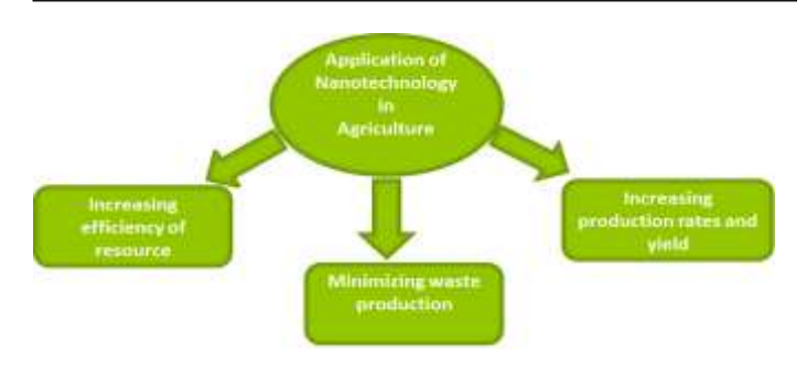
Figure 1: Major application of nanotechnology in Agriculture