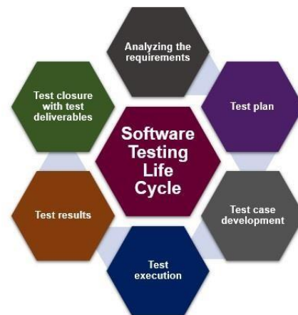
Fig 1. Phases of software testing life cycle

Fig 1. Cycle of software testing which comprises of requirements gathering and analysis, preparing the test plan for the entire test process, writing or scripting test cases, executing the test cases, comparing the results obtained from execution and finally test closure providing all test deliverables.