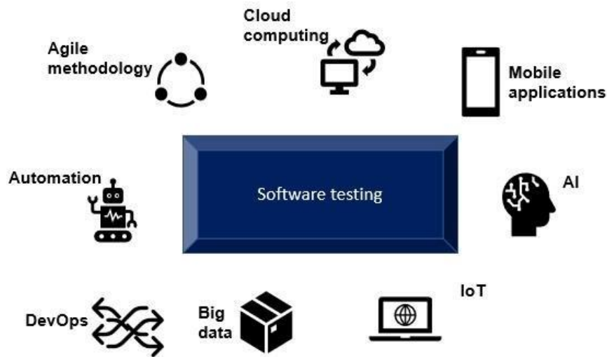
Fig 2. Trends in software testing

Fig 2. Latest technologies like Cloud, AI, IoT, Big Data, DevOps, Automation and Agile changed the way of testing a software. It enhanced the software testing process directing testing to be a though provoking process rather all manual tedious work.